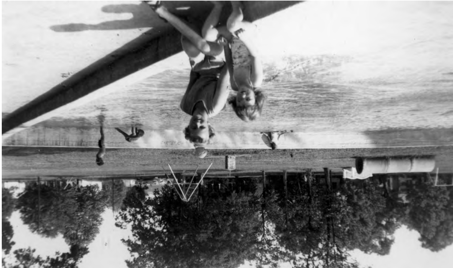
...So your children can tell their children